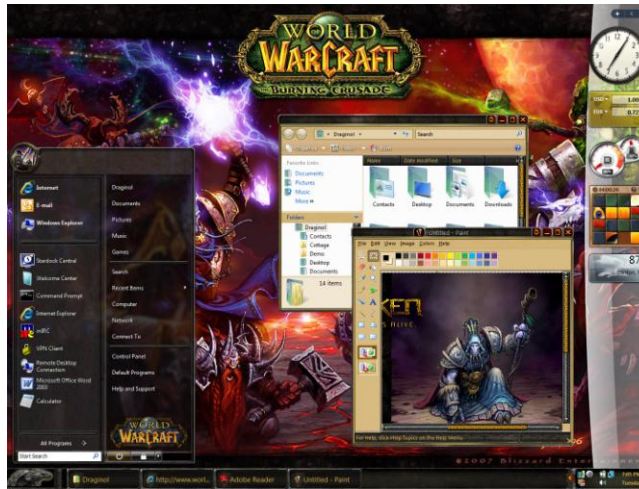
Figure 1: WindowBlinds applying a World of Warcraft skin. Note the title bars, start menu, scrollbars, and other changes over the normal Windows look & feel.